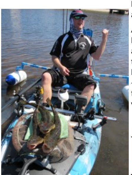
Who IS this?