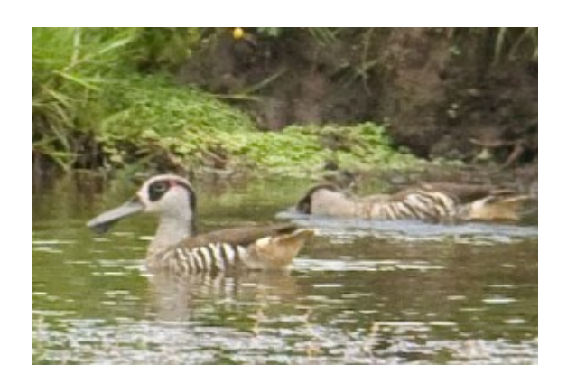
Jelat Jelat, Near Bega

Voice. Male:- A musical chirrup on the water and in flight. A sharp, high pitched "ee-jik" when alarmed.