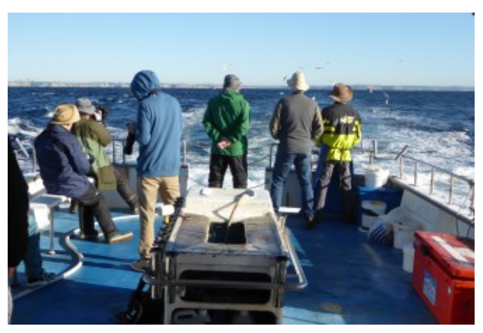
Watching and waiting