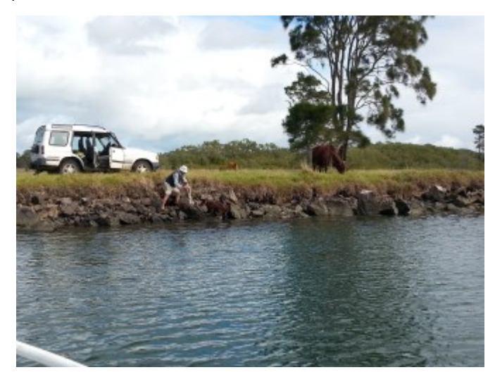
The lasso is readied—that's mum on the right

This Claim Form was accompanied with the following photos.