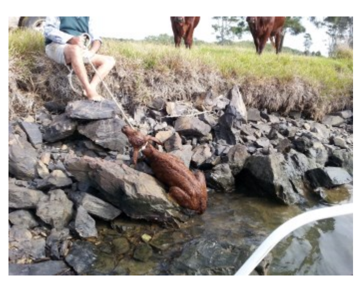
The deckie in action