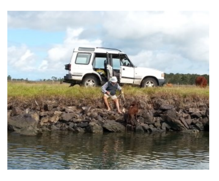
The poddy keeps moving out of reach