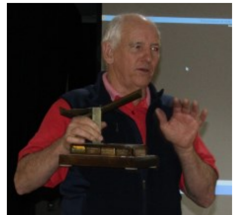
And looking good...