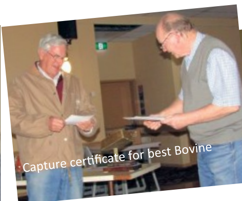
Capture certificate for best Bovine