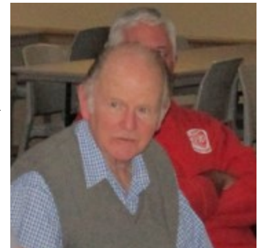
I have my eye on you