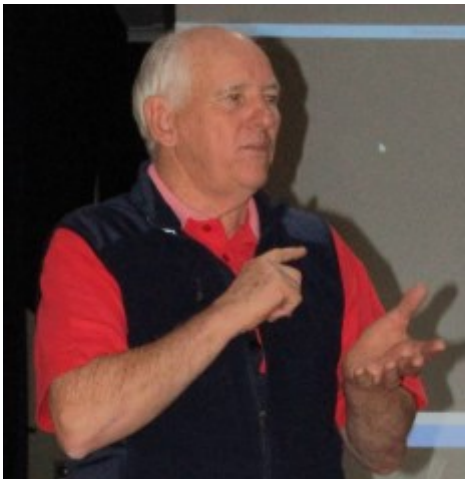
He is warming up...