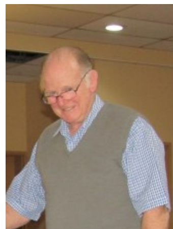
That worked—wasn't so bad after all, now to get on with it