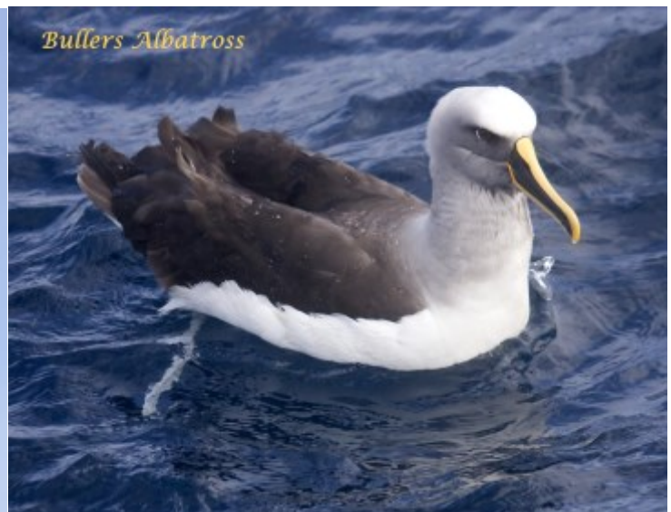
Photos from Sydney Pelagic Trip, June 16, 2016.