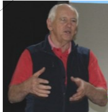
And sounding convincing