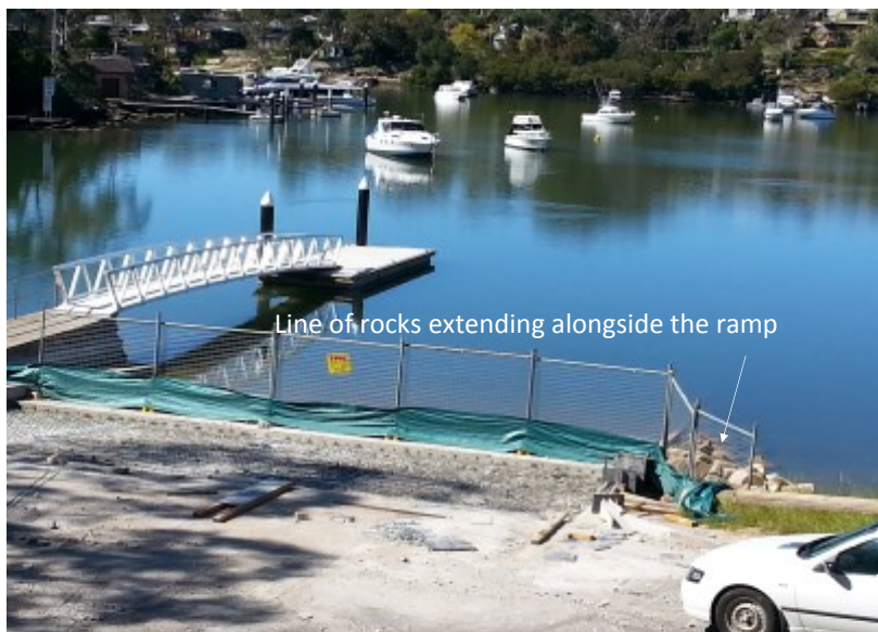
Line of rocks extending alongside the ramp

We need to give this a lot of thought, for this is a matter on which ANSA can act constructively to make a significant contribution to the future of our sport."