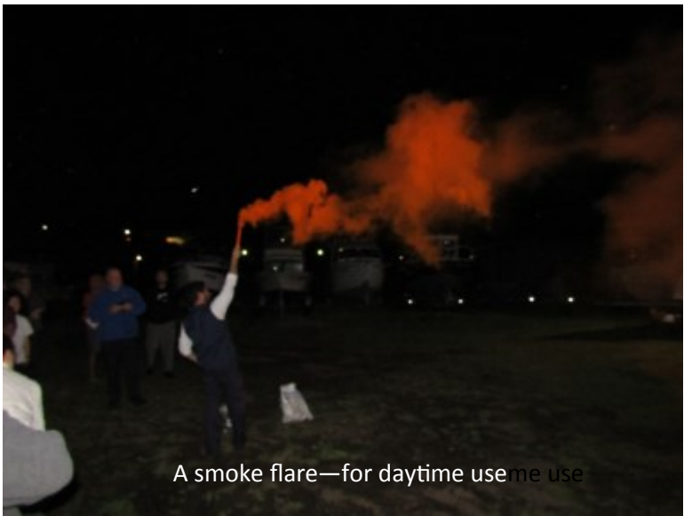
A smoke flare—for daytime use