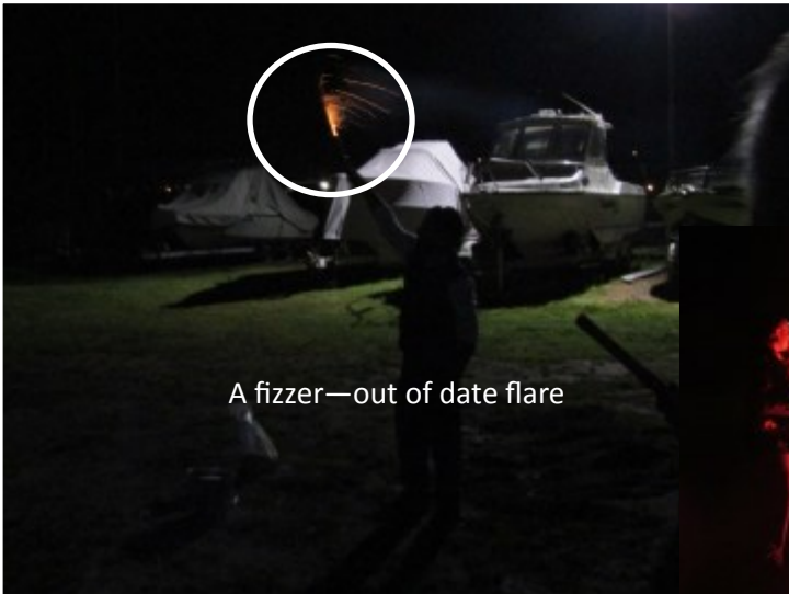
A fizzer—out of date flare