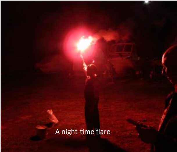
A night-time flare