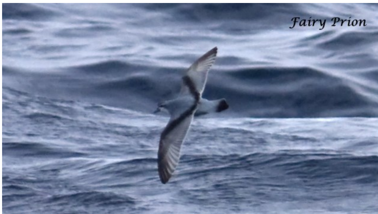
Photo from Sydney Pelagic Trip, June 16, 2016.

Feeding. Fairy Prions feed almost exclusively on Zooplankton which they collect by skimming over the water surface, sometimes "pattering" across the water, and also diving and swimming below the surface