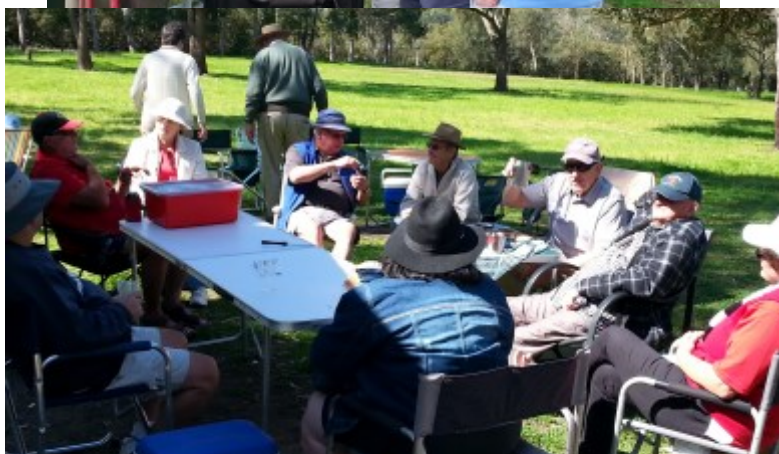
A few pics from the Oldies and Retirees Spring picnic