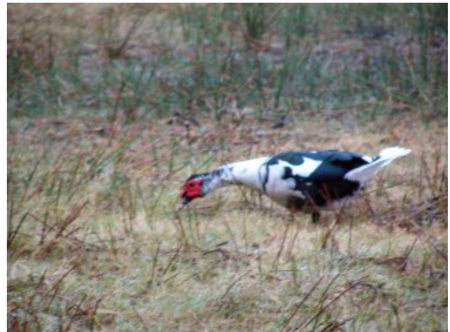
Leichardt Lagoon, Qld