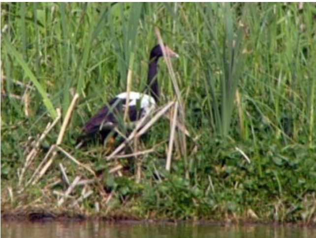
Hunter Wetlands, Newcastle