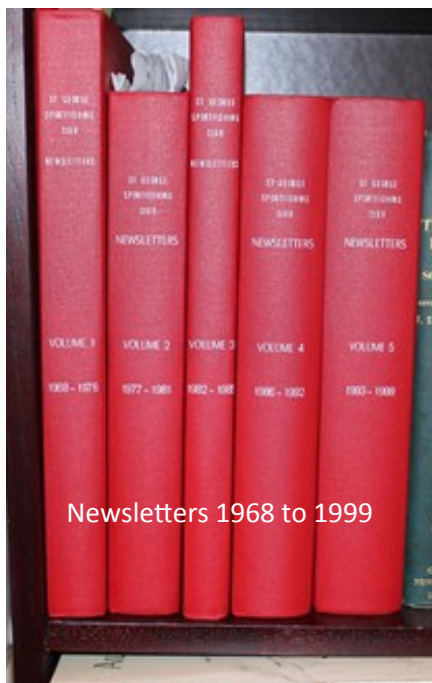
Newsletters 1968 to 1999

Our club will be 50 next year, having been formed in November 1968. For this event the remaining