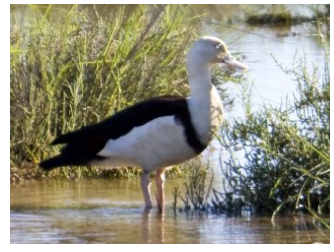
St Lawrence, Qld

Call. Male: hoarse whistles. Female: harsh rattling, usually in flight.