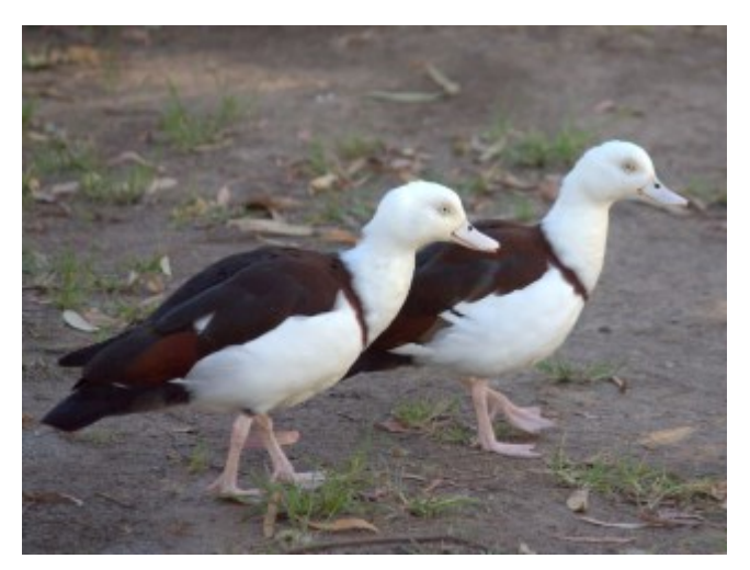
Bucasia Beach, Qld.