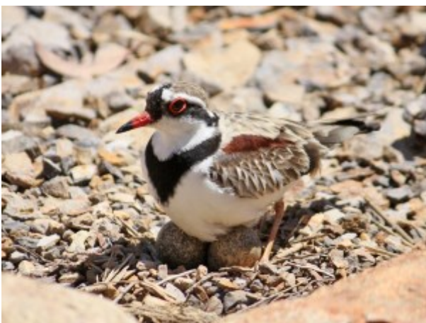
Nest on edge of gravel road,