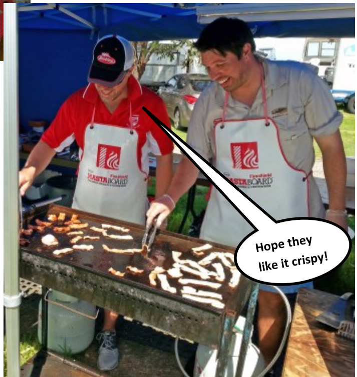
Hope they like it crispy!