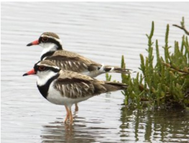
Ash Island, Hexham

Call. A liquid 'drip', tinkling rattles and churring.