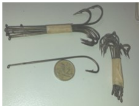
Tapered long shank hooks.