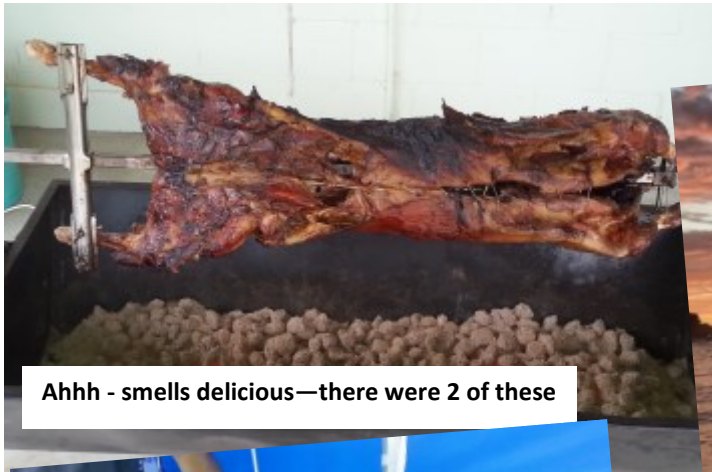
Ahhh - smells delicious—there were 2 of these