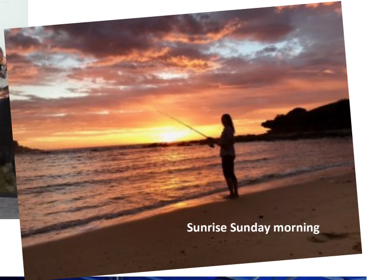
Sunrise Sunday morning