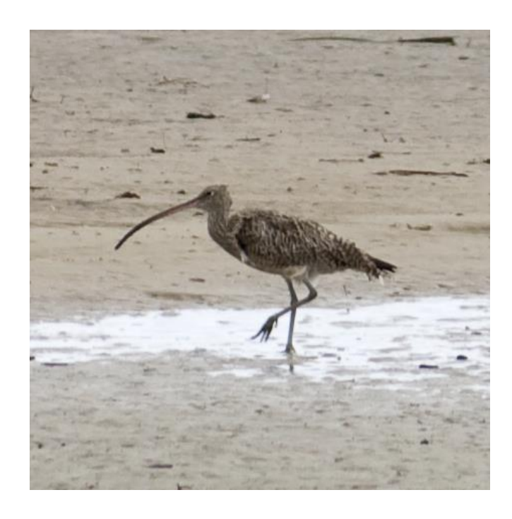
Male, Taren Point

Voice. Described as beautiful, haunting yet melodious. A two part "Cur-leee", rising on the second note.