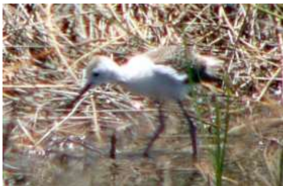
Juvenile - Towra Point